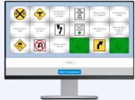
Driver's Ed Online Courses

Course materials are accessible through a third-party, user-friendly LMS and on all devices. Course progress is automatically saved so students can pick up right where they left off. Once they've finished the course, students can take their final test online, and after passing it, will earn their Certificate of Completion from an appropriately licensed school.